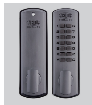
Digital locks are easily programmable to suit pass code of your choice. Full instructions are included.