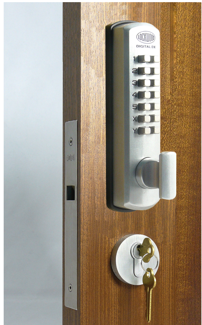
CL 100 DigiLock with key locking fitted to a timber veneer door.

Drawings & pictures are not to scale. All dimensions in millimetres.